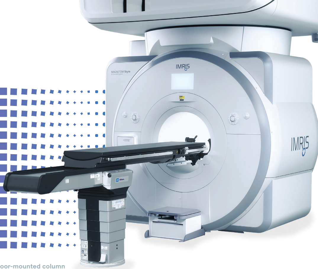
TS7500 Surgical Table Platform with floor-mounted column and MR Conditional* MR Neuro Tabletop.