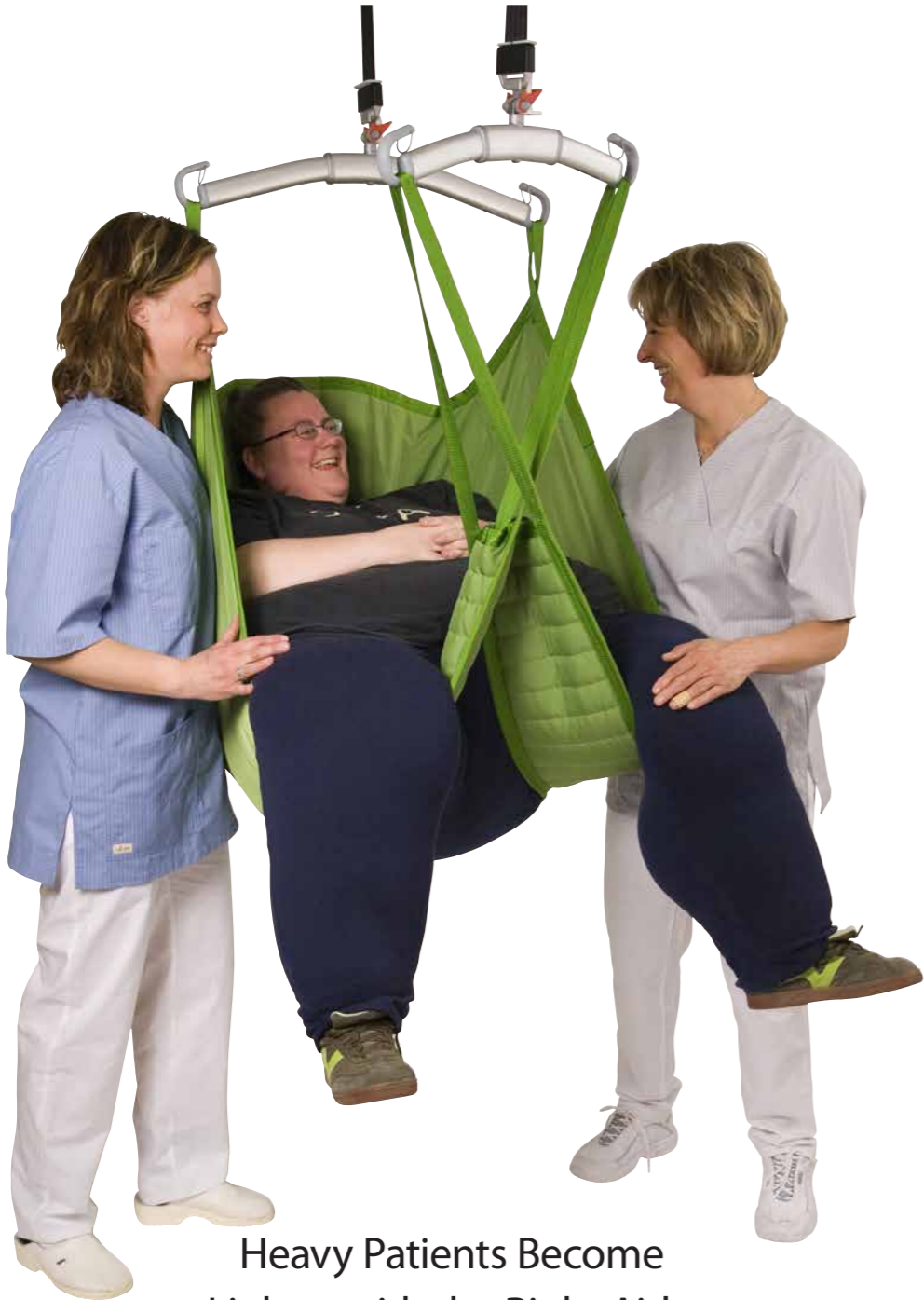
Heavy Patients Become Lighter with the Right Aids.

Lifting heavy patients requires special aids and special technology. With a maximum load of up to 500 kg (1100 lbs), the Liko™ UltraTwin™ system can handle really heavy lifts. Thanks to two interacting lift motors, the patient can be placed in a seated, semi-reclining or horizontal position. By controlling the two lift motors individually, the sitting position can be adjusted for maximum comfort. Liko has extensive experience of working with overweight patients. For many years we have worked in close collaboration with several large hospitals around the world which specialize in the care and treatment of bariatric patients.